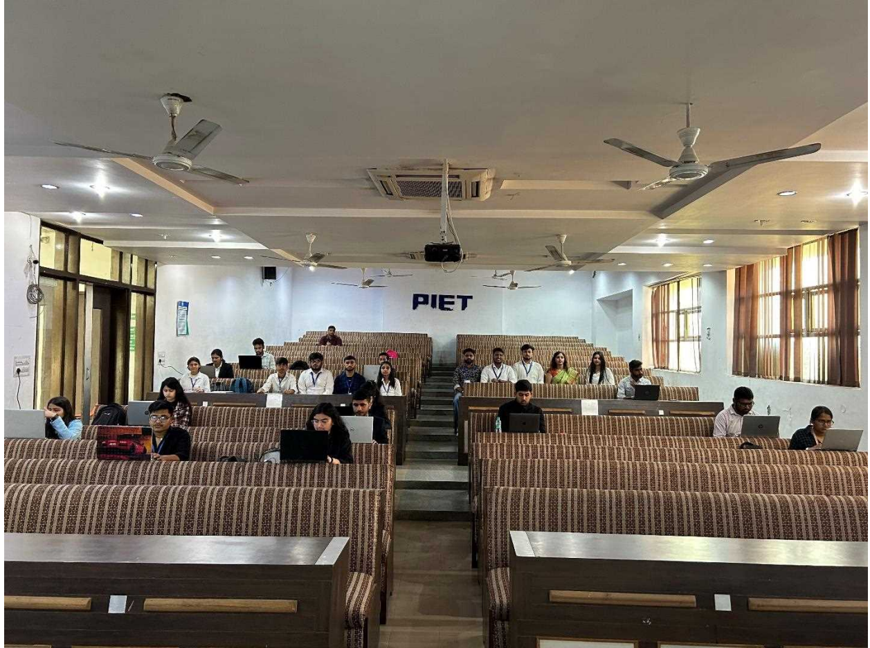
Pic: Workshop on Blogging Brilliance in Progress and students practicing blog writing