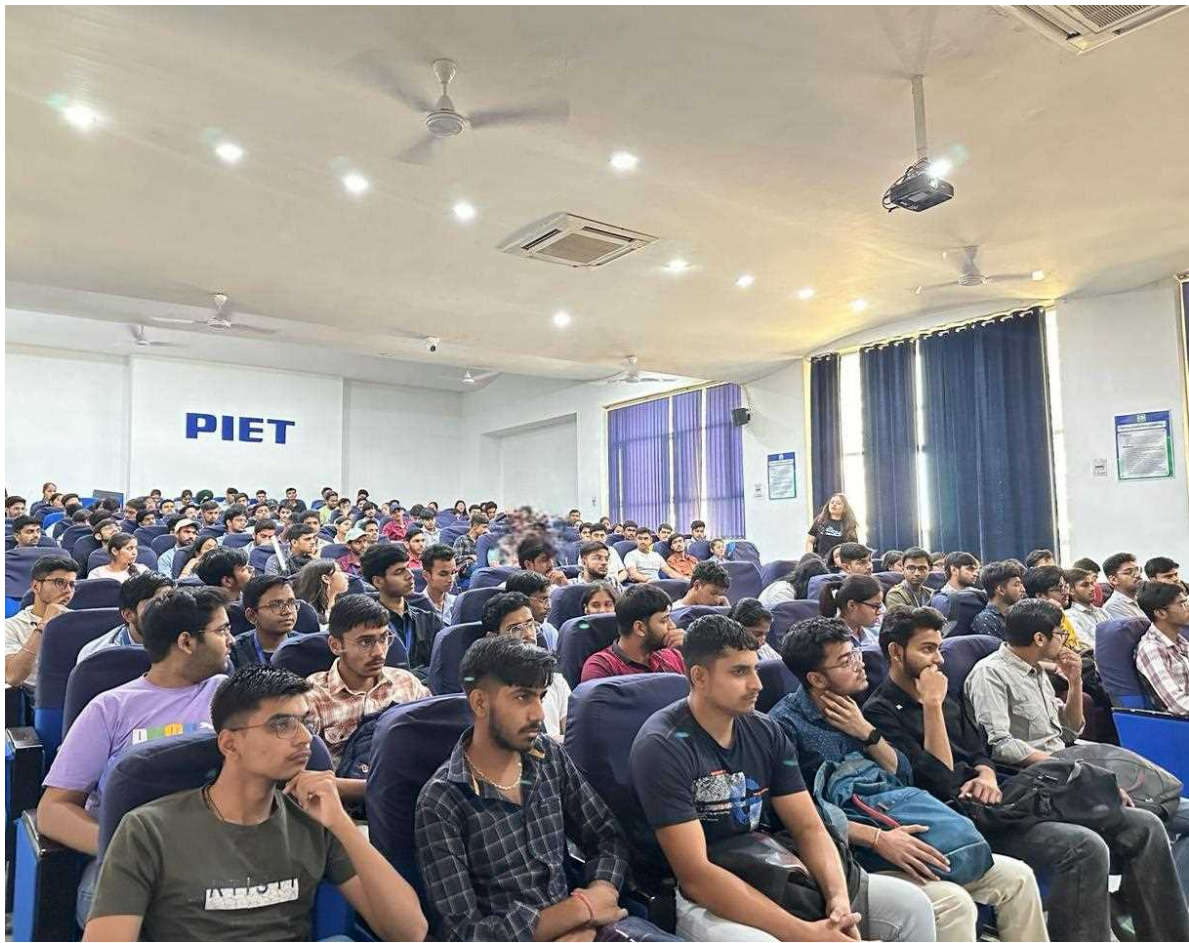
Pic 1. Students attending the workshop