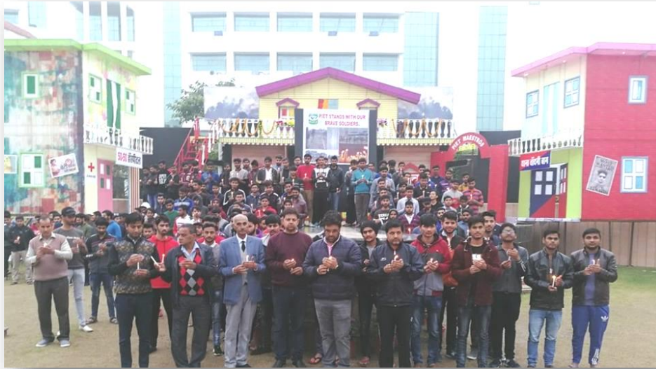
PIET students paid tribute to martyred army men killed in Pulwama attack