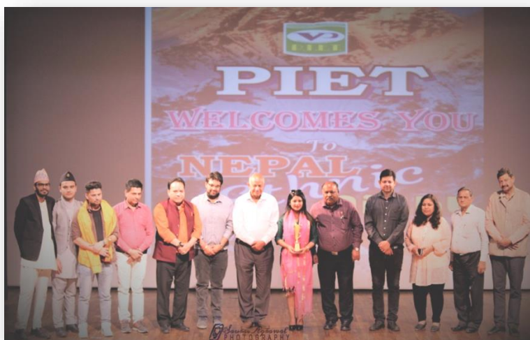
Nepal Actress Keki Adhikari in PIET for a cultural Program