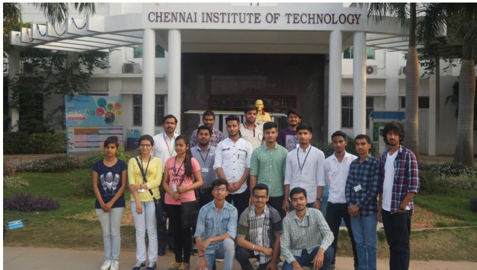
PIET students at CIT Chennai under student exchange

technology, electronics and communication engineering departments visited CIT Chennai from 17 th to 26 th June 2019. In turn the students from CIT also visited PIET and stayed in the campus during 2018 and 2019.