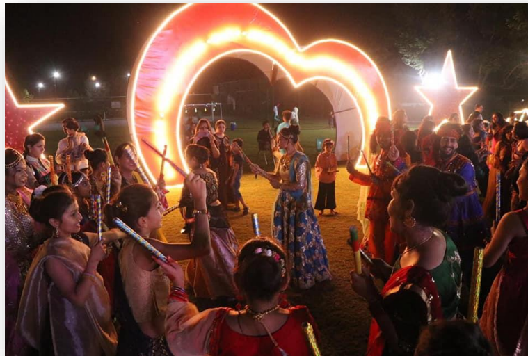
Glimpse of institute cultural function