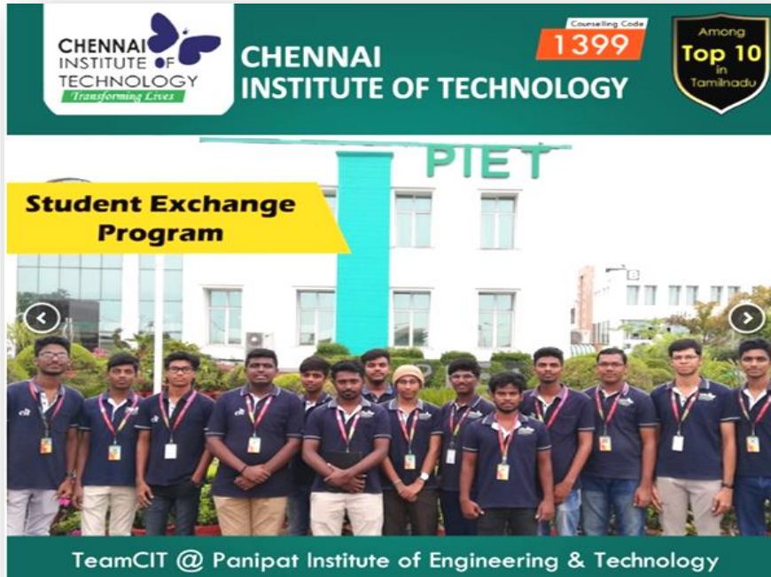
Above: Students from CIT Chennai at PIET, 2019