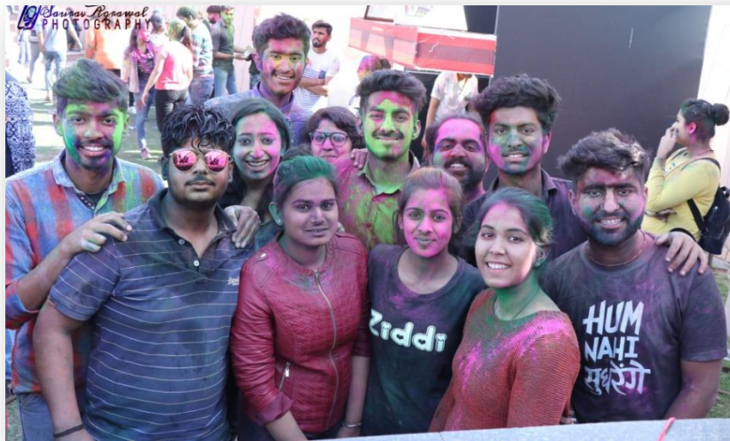
Holi Celebration at PIET

Snapshot from BBA newsletter available in the institute web through the URL: https://www.piet.co.in/wp-content/uploads/2016/05/BBA-E-news-letter-feb.ppsx