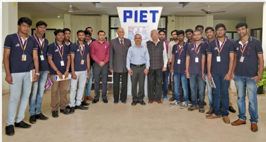
CIT Chennai students at PIET under student exchange during 2018