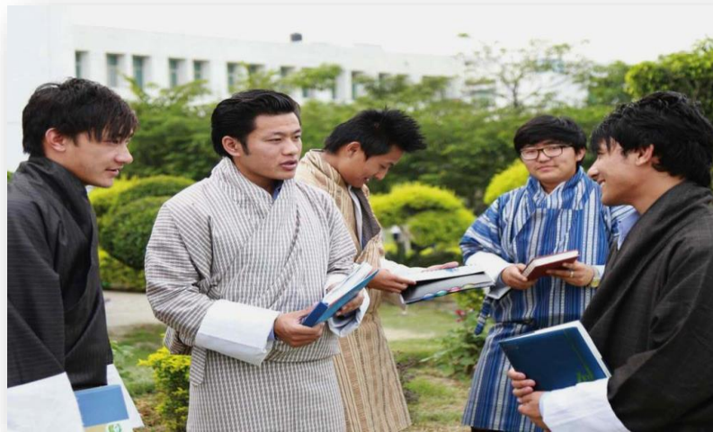
Diaspora of foreign students in PIET

PIET has a rich cultural mix of local students from Haryana and NCR with the students from other countries such as Nepal, Bhutan, Vietnam, Cambodia, and Bangladesh. Drawn from various places and countries, students have found PIET a home away from home. The institute, through its various initiatives and efforts tries to create an inclusive environment. Some of the institutional efforts are classified and described below: