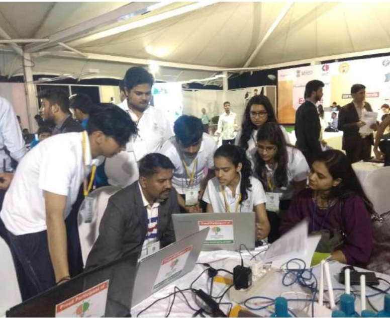
Presentation in front of judges